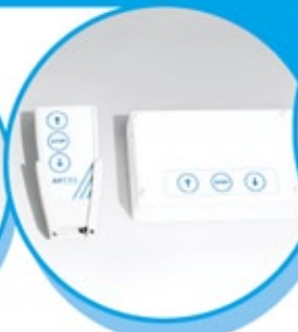
REMOTE CONTROL SET "CRC"