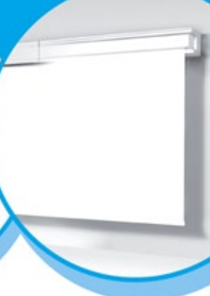
OUTER CASING "C-BOX"