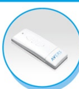
BUILT-IN REMOTE CONTROL "+RC"